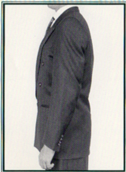
The rotation of the sleeve is for a more forward hanging arm. People who stand erect require a sleeve set for a backward hang to the arm.

O ne day someone from the leading custom clothing shop in his area sold him suits he thought were custom made. While he did order from a swatchbook, and waited 4 to 6 weeks, the suits in fact were factory made like almost all so called "custom" suits today—cut from a standard "block" pattern for a person of "average" posture. They cost about $1700 each! Surpris-ingly, he was happy with these clothes. Designer names, nice stores and status prices don't mean a thing where suits are concerned. They either fit your physique, or they don't look good!