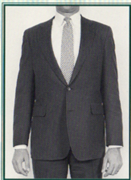
The jacket collar box gaps away from his neck. The front chest panels are too small. Note the wavy shoulders and twisted sleeves.