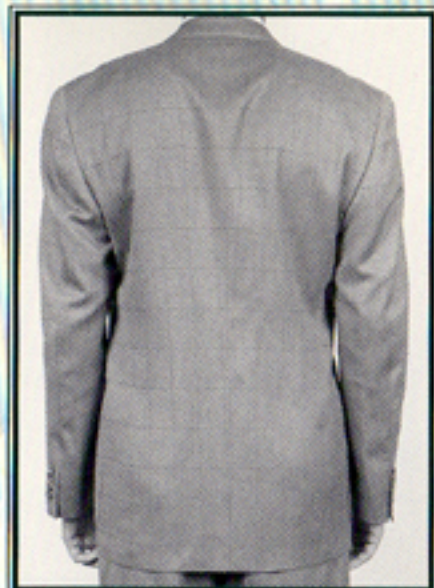
This famous name designer suit suffers all the same problems on a looser scale as his 1984 ready-made suit. Every ready-made suit will call attention to his fit problems.