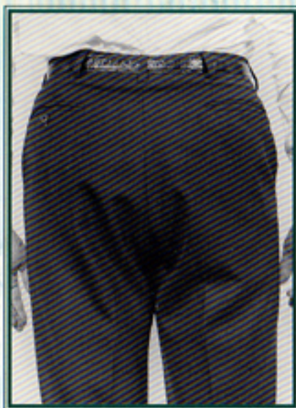
The seat shape is cut too round for him. The crotch depth (the rise) is too deep. The roll under the waistband is caused by his swayed back.

I n 1984, one of our clients referred us to a friend (pictured) who upon contact felt that he didn't need to have his clothes custom made. He came to us wearing the suit shown above.