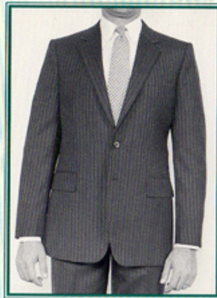
The collar box hugs the side of his neck. The front panels allow the lapels to close at the center of his chest.

All too often, men are too easily satisfied with clothing that simply doesn't make them look their best. Stores can't afford to give their customers expensive profit-losing alterations searching for the perfect fit. If delivering clothes that fit properly was a criteria for a store to stay in business, they would all close tomorrow!