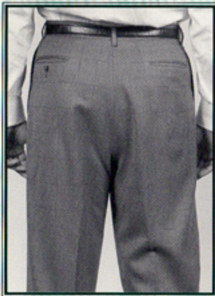
The crotch is too long and the seat too round. A slightly lower right hip causes the break behind the thigh and knee of the right leg.

S tyles changed. Our client moved away. His "off-the-rack" conditioning led him to think he would have to either visit us or find a local store to buy clothes. He began purchasing suits in a local store with a magic Italian name, but on inspection his new Italian suits didn't fit at all. In pursuing new styles, he sacrificed proper fit, both of which he could have had by calling us. His "shadow pattern" on file can accommodate any style change or weight gain. A "tailored" fit doesn't mean a tight one. It means a fit that conforms to your physique!