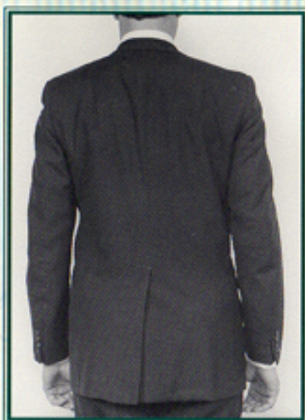
The jacket waist is too long. The jacket sits on his hips causing the vent to pull open. Improper sleeve rotation due to the backward hang of his arms causes the wrinkles down the back of his sleeves.