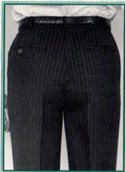
The rise, or crotch depth, and seat shape has been made to his shape, rather than a standard formula to go with his ready made chest size.

A month after ordering, he came to pick up his new suit which we had made to address 35 of his body measurements and his unique posture. No alterations whatsoever were performed! A pattern of his physique, somewhat like his shadow, was made and kept on file. A comprehensive inspection ticket of finished measurements is kept for reference on each suit and is modifiable for new styling and/or weight changes.