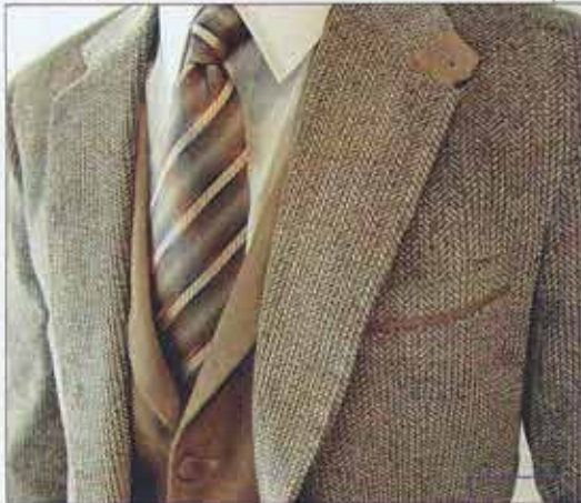
Cotton corduroy herringbone jacket with slant pockets, suede piping and throat latch over a suede vest with notch lapels.