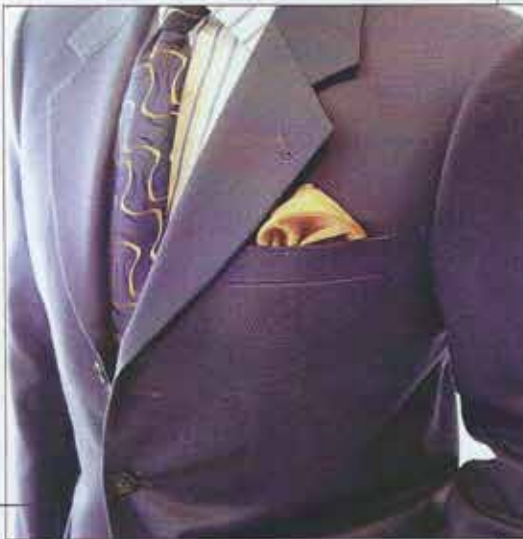
Single-breasted diamond weave self-design pure 10-ounce worsted wool in Royal Navy (available in a variety of other colors) with an Italian silk tie and coordinated silk pocket square.