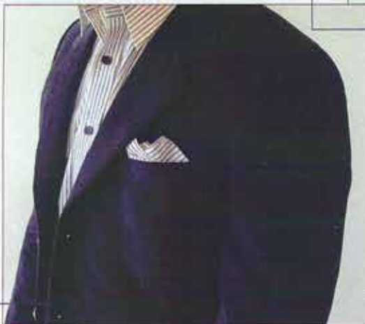
Single-breasted sports coat in cashmere cotton corduroy fabric.